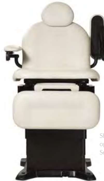
Shown with options (047 Self-Leveling Arms)