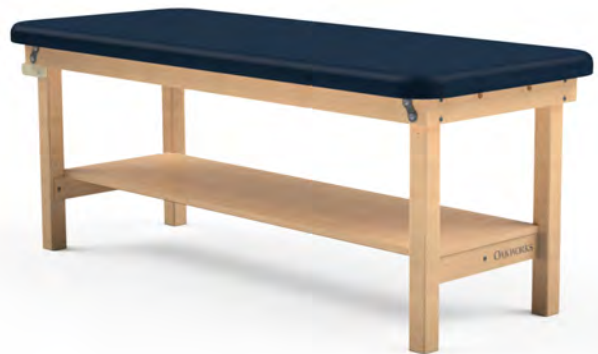
Sapphire fabric, Natural Finish and optional storage shelf