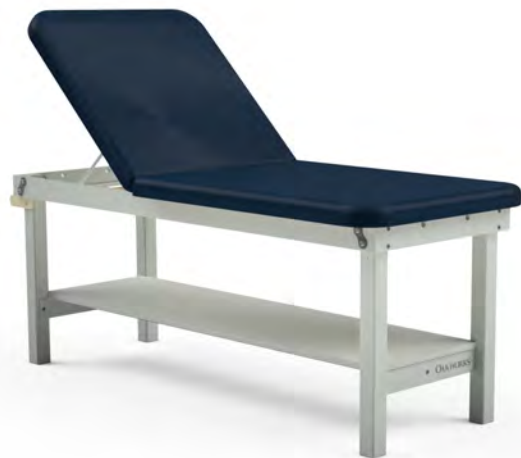
Sapphire fabric, Grey finish and optional storage shelf