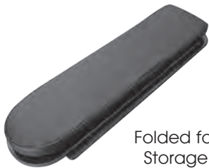
Folded for Storage