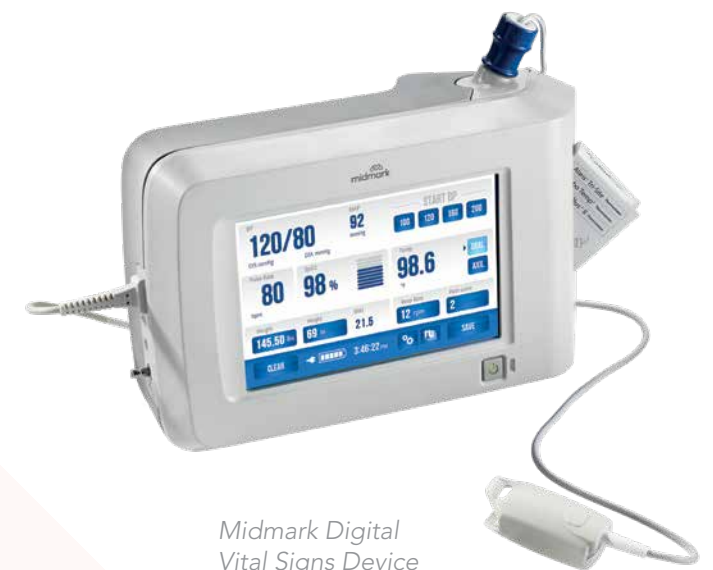
Midmark Digital Vital Signs Device with Masimo® optional SpO 2

Using a Ritter® Barrier-Free exam chair with an automated vital signs device like Midmark® Digital Vital Signs Device allows you to automate vital signs capture at the point of care, saving time and reducing transcription errors. Once vital signs data is captured, it can be imported directly into the EMR.