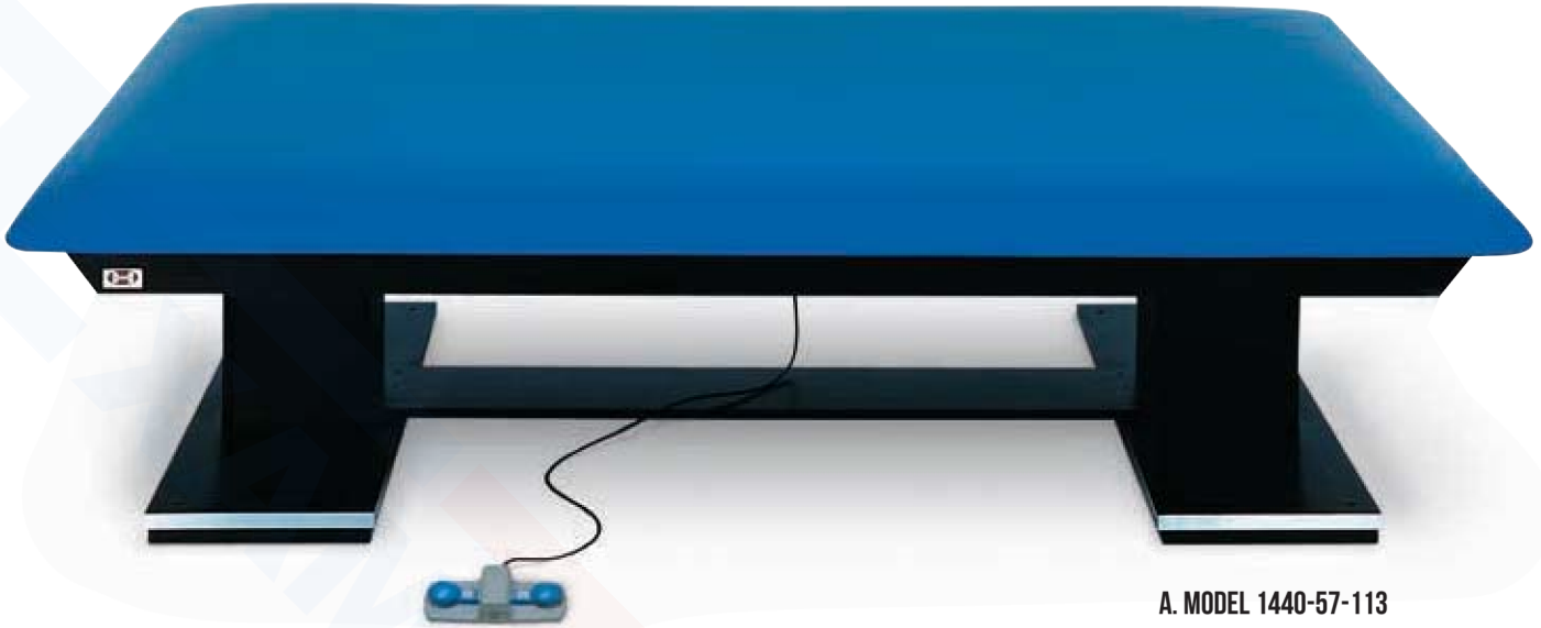
A. MODEL 1440-57-113