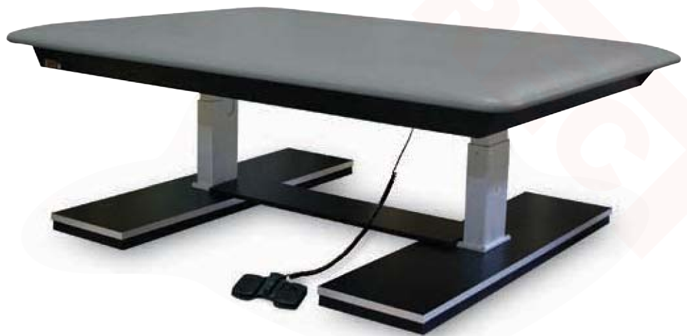
B. MODEL 1441-47-119

You must specify upholstery color with order.