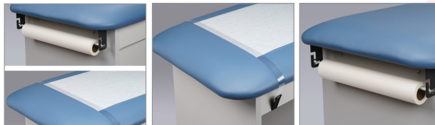
034- Paper Dispenser & Cutter Combo