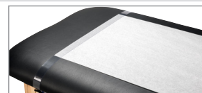
040- Paper Holder