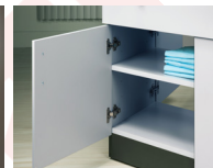
Both Sides Access