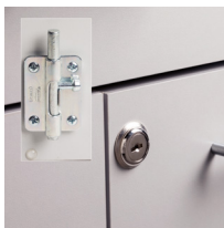
066 Door Lock & Inside Latch Combo