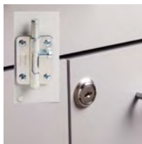
066 Door Lock & Inside Latch Combo