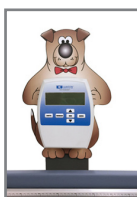
078-D Doggie Scale Pal