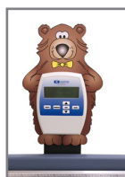
078-B Bear Scale Pal