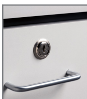
055 Drawer Locks