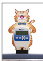
078-K Kitty Scale Pal