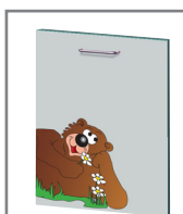
Select Series Graphics