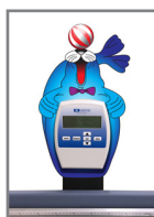
078-S Seal Scale Pal