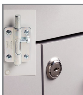
066 Door & Inside Latch Combo