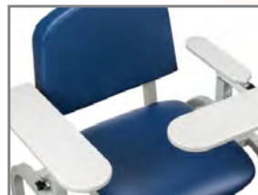
665 ClintonClean™, Armrests and Flip Arm(s)

California residents please be advised of the following, pursuant to Proposition 65: