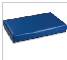
060 Large Pillow