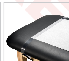
040 Paper Cutter