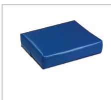
020 Small Pillow