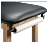
030- Paper Dispenser