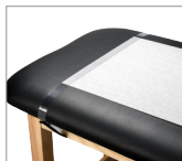
040- Paper Cutter