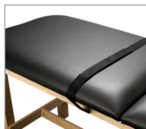
077- Positioning Strap