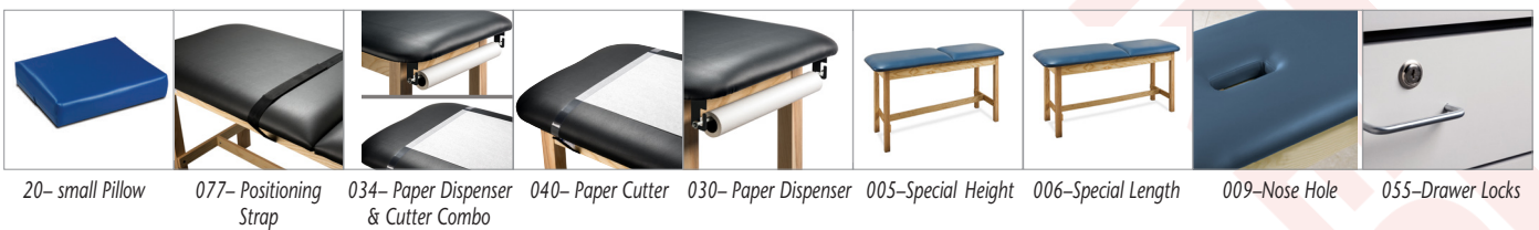
20- small Pillow