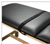
077- Positioning Strap