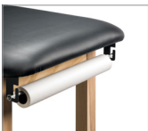
030- Paper Dispenser