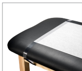
040- Paper Cutter