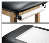
034- Paper Dispenser & Cutter Combo