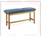
006- Special Length