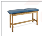
005- Special Height