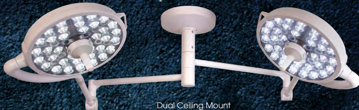
Dual Ceiling Mount