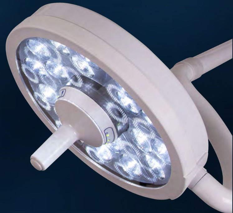
MI-750 Dual Ceiling Mount