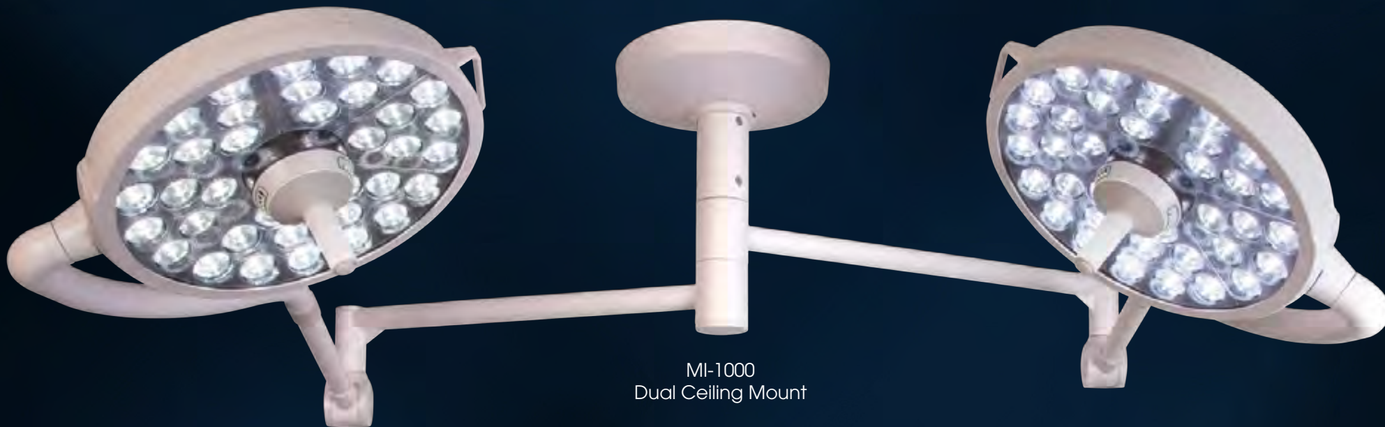
MI-1000 Dual Ceiling Mount