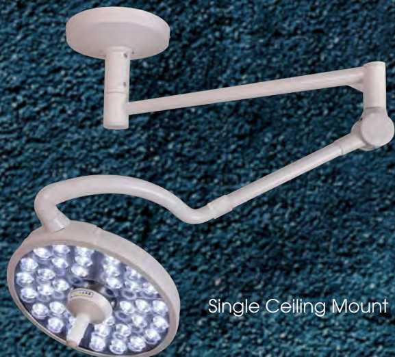
Single Ceiling Mount